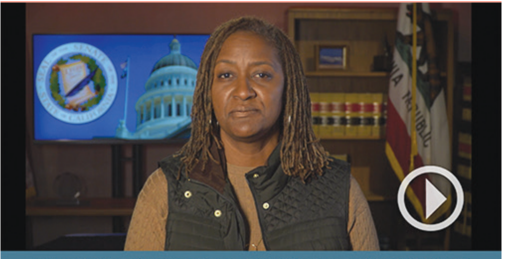
Reflecting on the Myth of the Welfare Queen

We look forward to this journey with you!