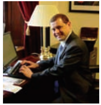
Congressman Tom Perriello.

Part of what I wanted to do in the campaign was give people an authentic sense of who I am. Then people can understand that, for example, I'm already spending serious time on new approaches in Āfghanistan—but that's not in place of focusing on job creation