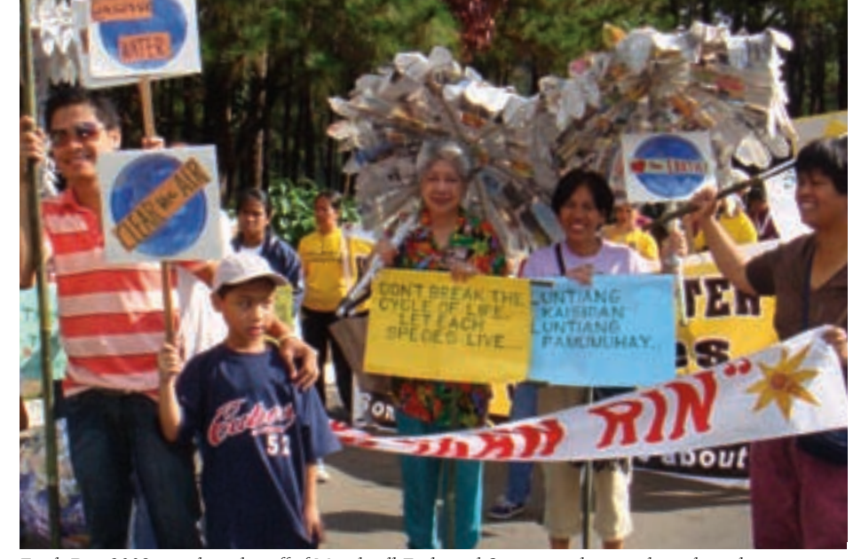
Earth Day 2008 parade with staff of Maryknoll Ecological Sanctuary showing their placards.

water to drink and clean water with which to cook and wash. Women walk to sources of safe water that are kilometers away from their homes in the mountainous areas. Of course, children are also obliged to haul water.