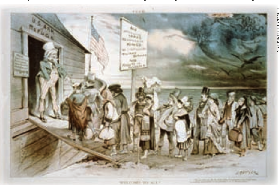
An 1880 cartoon, "Welcome to All," in the journal, Puck, depicts Uncle Sam welcoming war refugees.

find a way forward we must change. If we stay centered in the Spirit, I believe we will respond in ways that are healing and productive. I know I am different for coming to understand the perspective of a Minuteman. I am also different for having heard firsthand stories about the Postville raid. May we all be led to share life-altering stories and engage this global impasse for the common good.