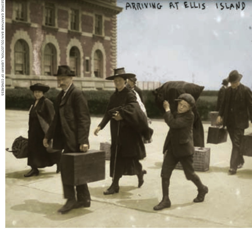
Our nation's immigration history is long and complex. While most U.S. citizens are descended from immigrants—or are immigrants themselves—many of today's newcomers face racism, fear and prejudice similar to those faced by earlier generations. Below: A U.S. roadway runs along the border fence between Arizona and Mexico.

Since that time, nothing comprehensive has happened. A border wall is being built along the Mexican/U.S. bor-