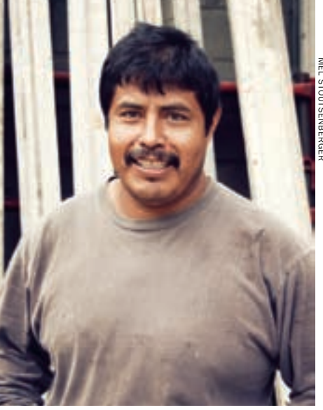
Above left: Naturalized citizens attend "I am an American" day rally in Buffalo, NY, 1943. Above: A worker from Mexico.

STORY: You had some bad luck when you were a teenager and were forced to drop out of school. At the time, you were able to find work to help your family, but your employer closed and you cannot find a new job. Not having a high school degree limits your options. You apply and apply, but everywhere you go you see undocumented workers taking the low wage jobs.