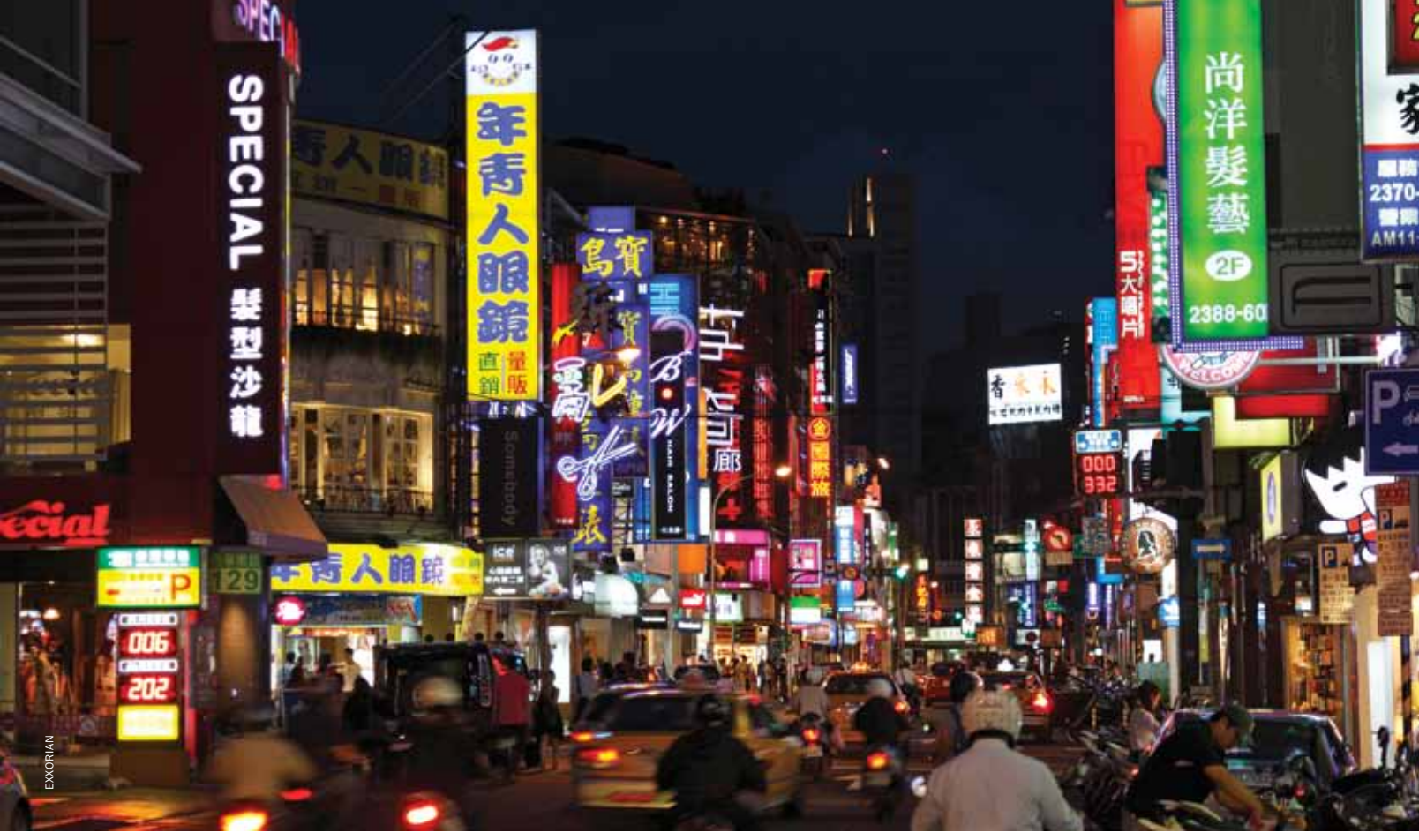
The busy commercial district of Ximending in Taipei, Taiwan.

Mandarin, and only make friends with Chinese people. Since there are few people from different ethnic groups in his daily life, he could hold on to his own stereotypes about white people, black people, Jewish people, Latin American people, Korean people, etc. because he did not build up an environment that includes interaction with different groups of people.