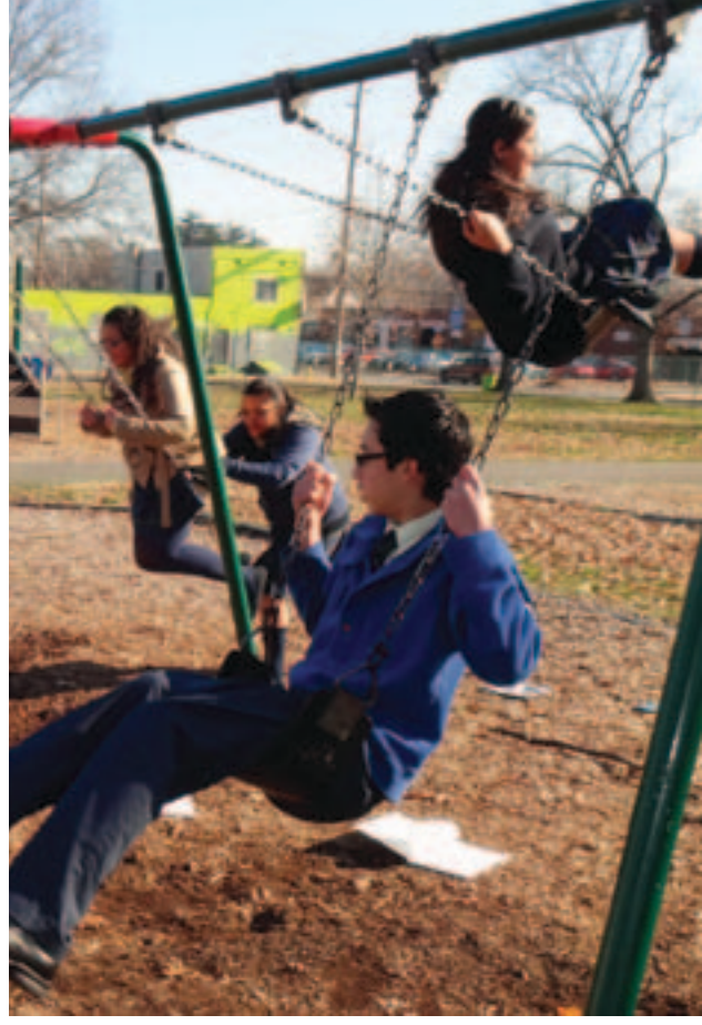
Youth advocates enjoy swings they got the county to refurbish. They were participants in the Student Leaders' Von Nieda Park Task Force summer program, sponsored by their school, St. Anthony of Padua in Camden, New Jersey. See story on page 12.

cal decisions facing our nation regarding gun violence, the budget, immigration reform, climate, etc., we hold the needs of our children's children at the heart of our concern. If we make decisions that will benefit them, then we will fulfill both our constitutional mandate and Christ's call. It will be for the good because the reign of God belongs to our children's children.