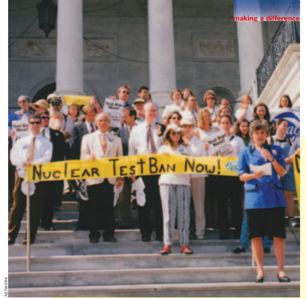
Author (in blue) speaks out at nuclear test ban treaty demonstration in front of U.S. Capitol.

Treaty comes up again. We also lobbied for cuts to military weapons such as the F-22 fighter jet, which did get cut, even though it took ten years.