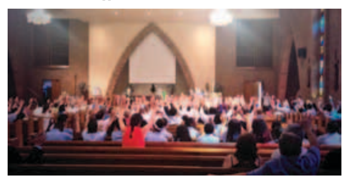
Supporters raise their hands for immigration reform at St. Joseph's Pro Cathedral in Camden, New Jersey

value of diversity and their own dreams and challenges.