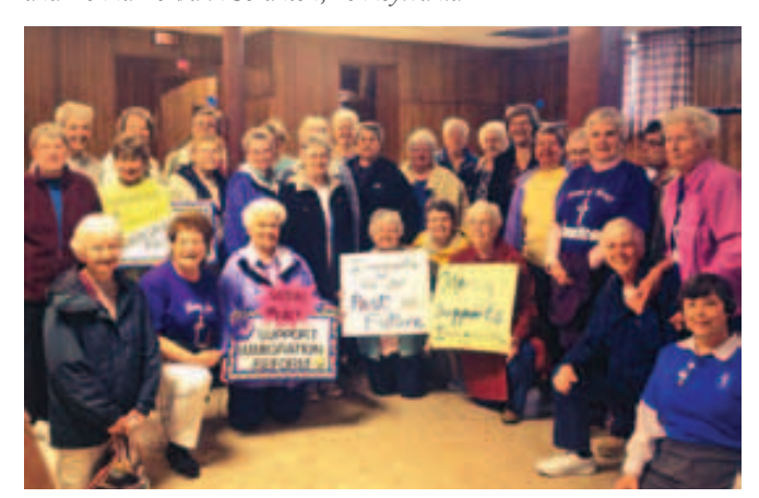
Sisters show their support in New Haven, Connecticut