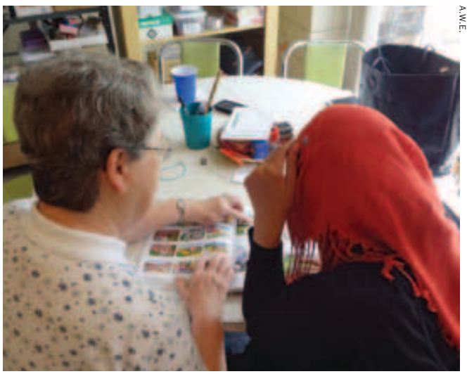
Working with asylee

lum-seekers is scarce. Although asylees are here legally awaiting their asylum, they do not receive any government benefits and often have to wait until their asylum decision to even receive work permits. Without money or home, they live in a transient mode and often find themselves in dangerous shelters and situations.