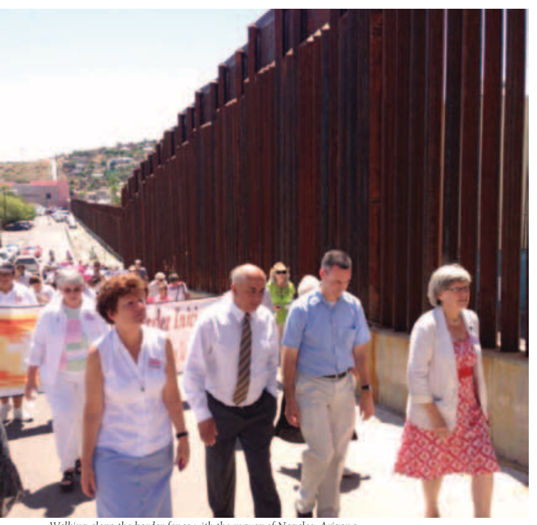
Walking along the border fence with the mayor of Nogales, Arizona