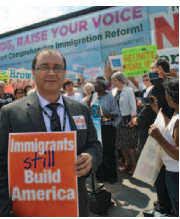
Crowd gathers at the office of Senator Chambliss in Atlanta