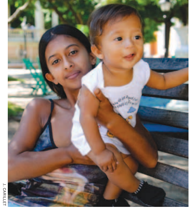
A 17-year-old mother and her child.

sandwiches tossed at them, and being treated rudely seemed to be the norm.