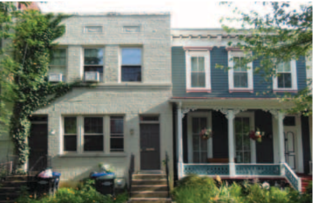
Capitol Hill neighborhoods undergoing change. "One can't overlook the disruption ['gentrification'] causes for people who have few resources."

learn from my best teachers. As Pope Francis recently told a Vatican conference on ethical investing, it is increasingly intolerable that financial markets are shaping the destiny of people rather than serving their needs.