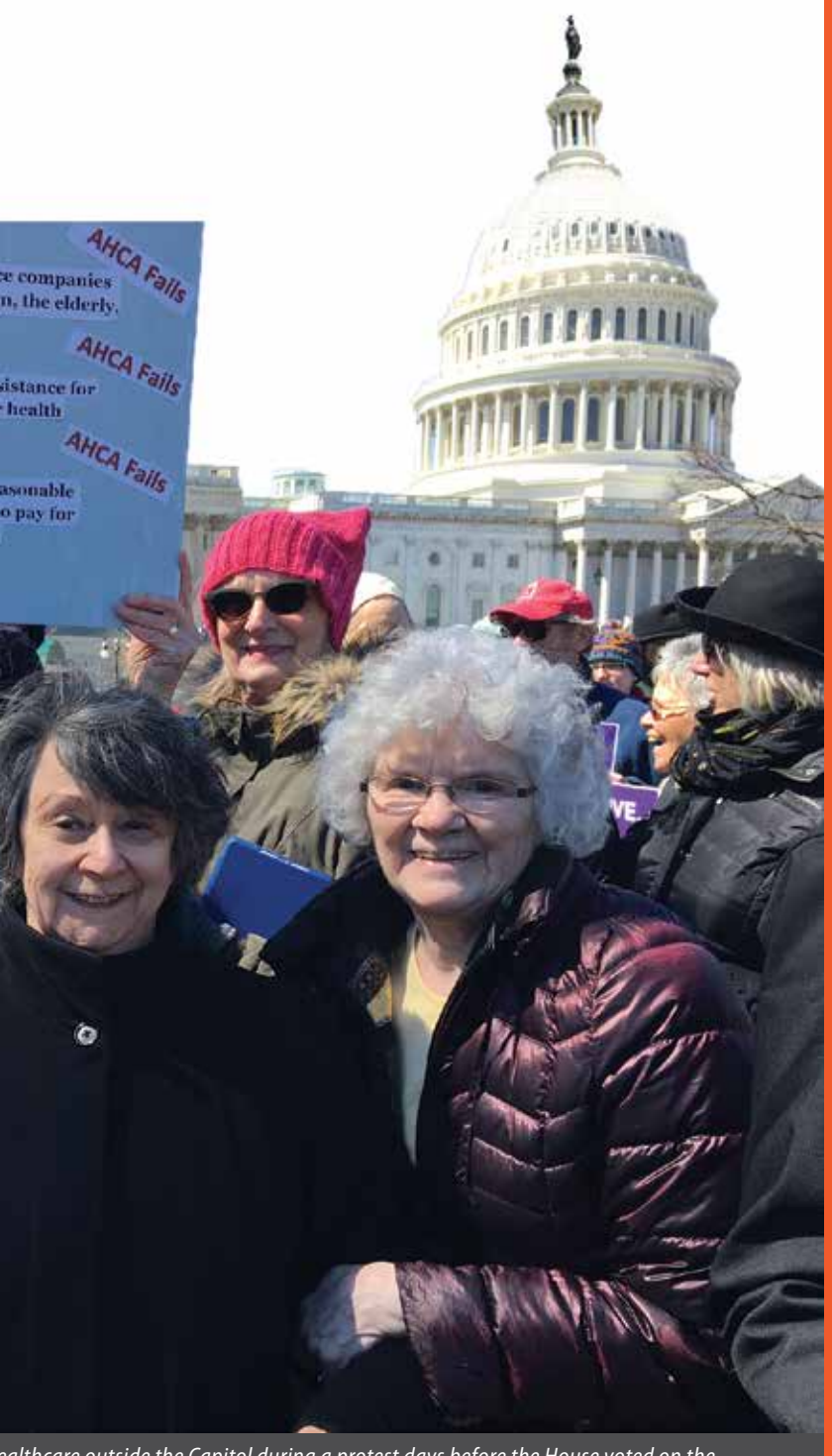
ealthcare outside the Capitol during a protest days before the House voted on the