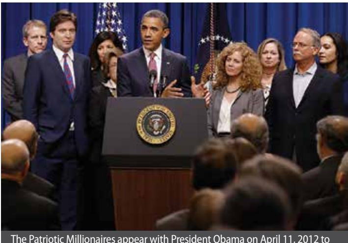
The Patriotic Millionaires appear with President Obama on April 11, 2012 to call on Congress to enact the Buffett Rule.

In a political system that has become more of an oligarchy than a democracy, the power of the group lies in being seen as members of the "elite" class arguing against their perceived self-interest. Elected representatives have grown accustomed