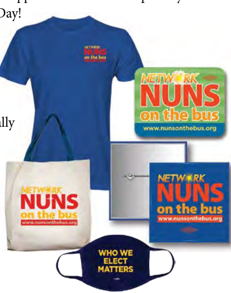
To get your NETWORK merchandise, go to networklobby.org/store

So whether though the Live Events, the Interactive Experience, or the Election Store, NETWORK invites you to come along with virtually in 2020 as we explore our nation and learn about the common good from a variety of perspectives — and prepare to vote for the common good in this upcoming election.