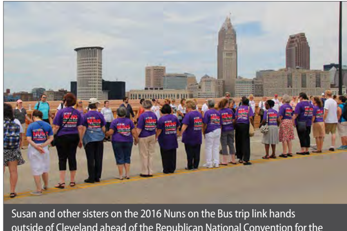
outside of Cleveland ahead of the Republican National Convention for the "Circle the City with Love" event.

Sadly, the divide has deepened and the gaps seem even wider today. I believe that this 2020 election comes at a critical time