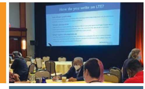
NETWORK advocates learn how to write compelling Letters to the Editor (LTEs).