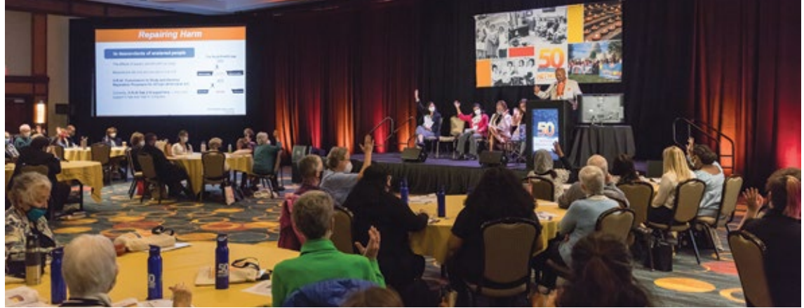
The NETWORK Government Relations Team educated Advocates Training attendees on the Build Anew Agenda to kick off the three-day event.

During a break in the training, advocates enjoyed an ice cream social.