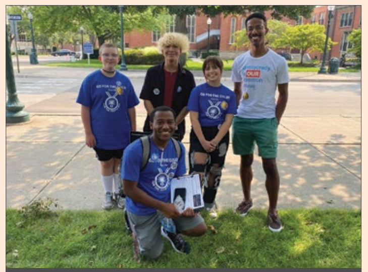
Justice-seekers organized and executed 20 "Team Democracy" events last year, engaging more than 400 people, including democracy advocates in Monroe, Michigan shown here.

Because racism is embedded into our society's systems and structures, we intentionally prioritize dismantling systemic racism and white supremacy in our political systems as well as our economic and social structures. To do this work for racial justice effectively, advocates must engage in ongoing development and learning about racial justice and regular self-reflection. NETWORK resources are available to equip you to do the work of racial and economic justice, organize in solidarity with people of color, and educate yourselves and others in your community about racism.