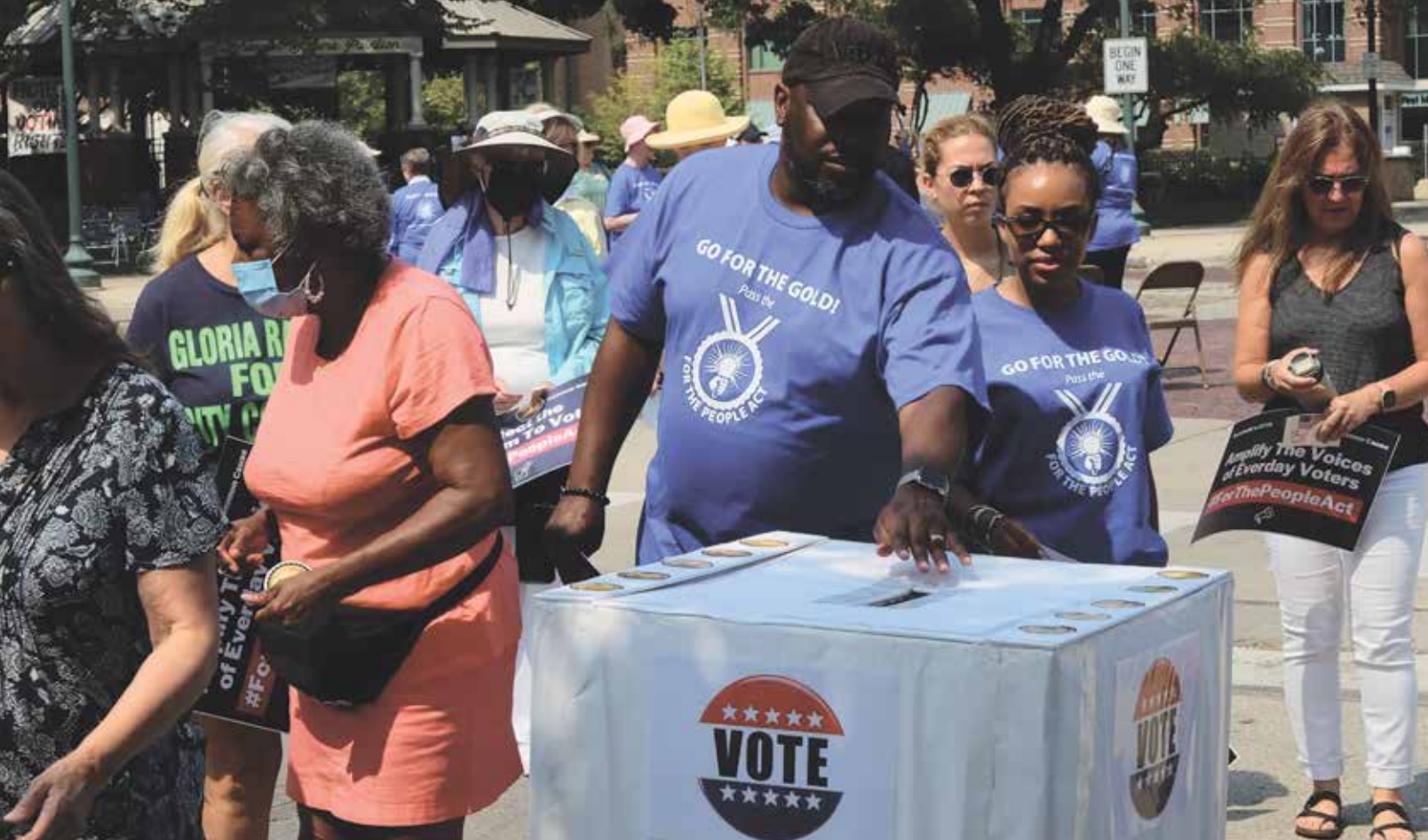
People cast their votes for federal democracy reform as part of NETWORK's "Team Democracy" events across the country in 2021. Voting rights, which have come under threat at the state level since the U.S. Supreme Court gutted the Voting Rights Act in 2013, are a key component of NETWORK's efforts to defend democracy.