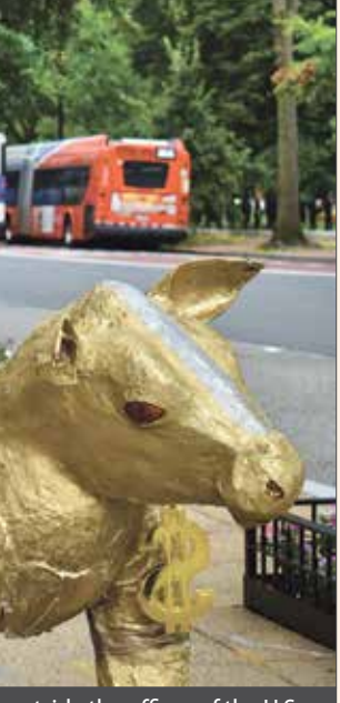
t outside the offices of the U.S. e corporations over the negotia-