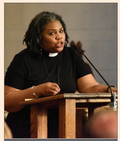
Rev. Traci Blackmon, Associate General Minister of Justice & Local Church Ministries for The United Church of Christ, speaks at NETWORK's reparations vigil in Cleveland.

first Black nuns had to establish their own congregations because they were not welcome. And it still makes me wonder, what happened to the dignity of all humans? You just don't know what to do with that sometimes."