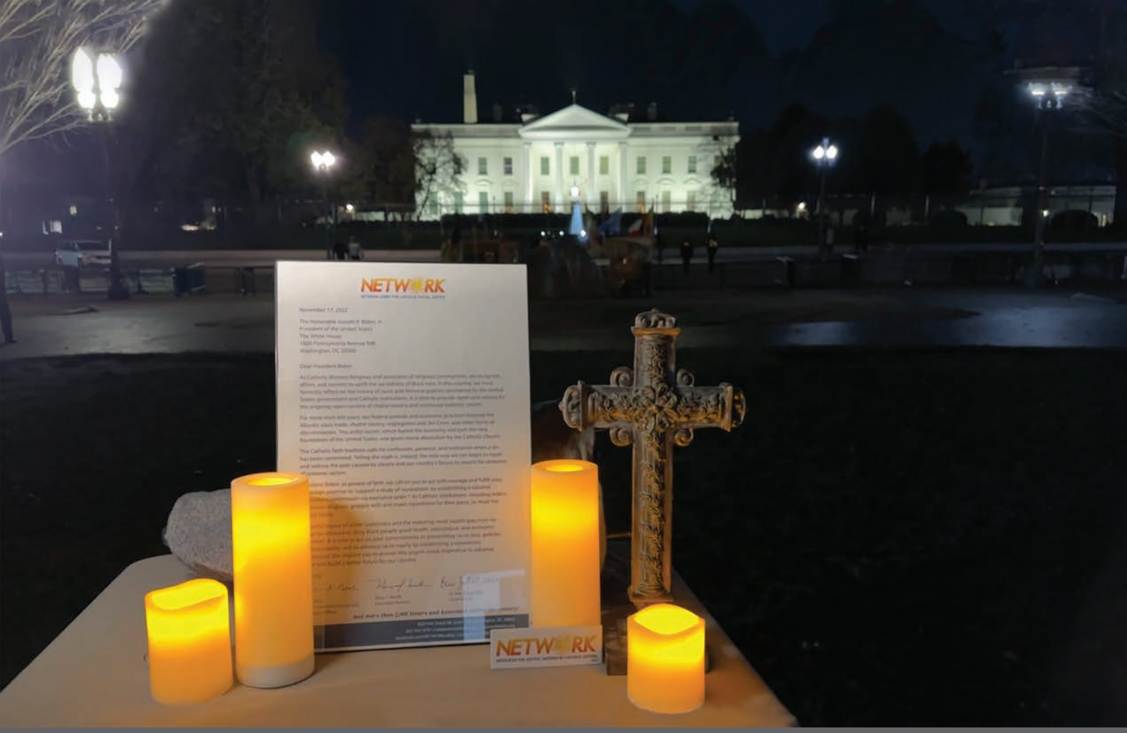
In November 2022, NETWORK delivered a letter to the White House calling on President Biden to establish a reparations commission via executive order. The letter was signed by more than 2,000 Catholic Sisters and Associates of Congregations of Women Religious.